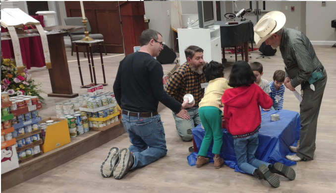
Starting the "construction" of the lighthouse.