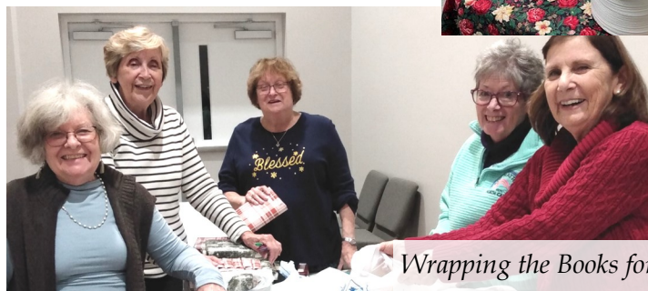
Wrapping the Books for Vick.