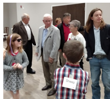
Who Am I? Can only ask yes or no questions to figure out which nativity character you are.