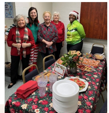
Christmas treats for the staff.