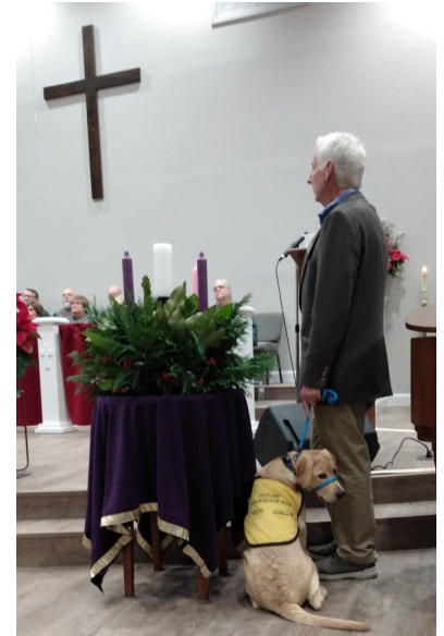
Lighting the Advent Candle