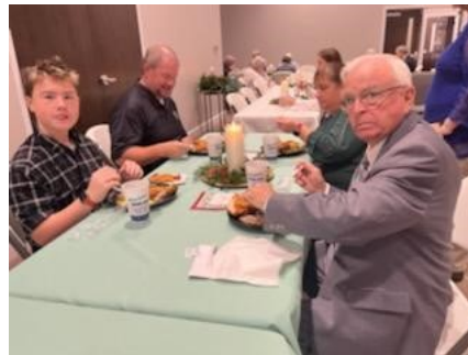
Enjoying the catered lunch