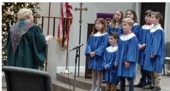
Children's Choir sings on Dec. 10.