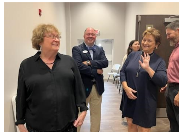
Waiting to be served lunch.