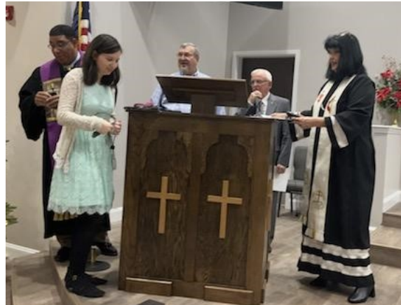
Consecrating the pulpit.