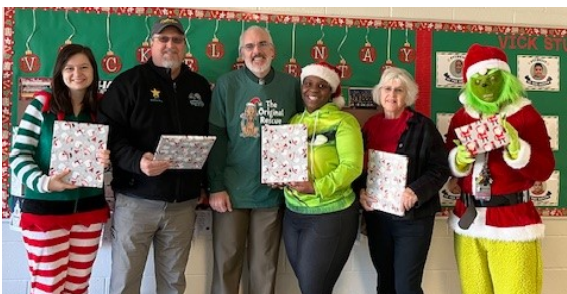
All 330 books were wrapped before being handed out on Tuesday, December 19. If you could see their faces when they get these books!

Please continue to keep the students and staff in prayer for safety and success during the coming year.