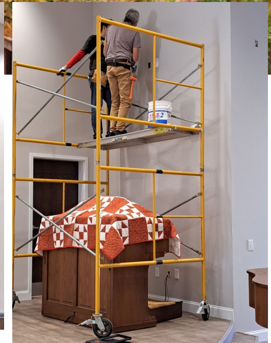
Then install TV monitors over the organ. Yikes!