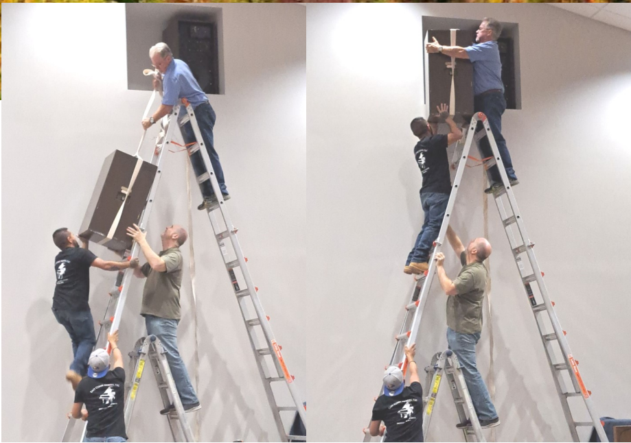
How do you install 90 lb. organ speakers near the ceiling? VERY carefully!