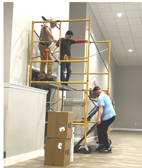
There will also be a monitor over the door so that those in the chancel area can see it.