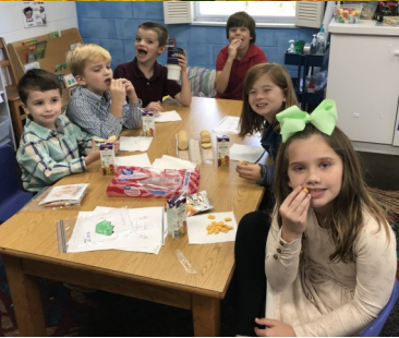
Children's Sunday School students enjoy a snack.

Winstead's booth at the Fall-a-Fair on October 7. We sold peanuts and BBQ sauce, and invited all to church at our new location.