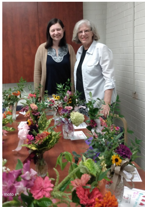
Flowers for Vick Elementary School staff, prepared during the Winstead Summer of Service August event.