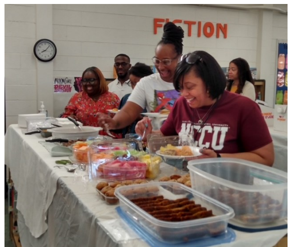
Staff Breakfast at Vick Elementary

The Hand in Hand Committee met on August 1 to plan ways to support our partner school, Vick Elementary. The first activity of the new school year was a back-to-school breakfast for the staff, which was held on Monday, August 21. At the breakfast, we distributed Prayer Partner forms for staff members who are interested in participating. So far, we have received participation forms from 25 staff members. Once again, we will invite our congregation to sign Prayer Partner cards each month to send to our Prayer Partners. We will