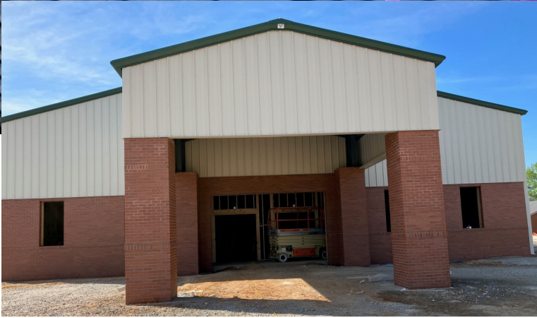
Sunday, April 2